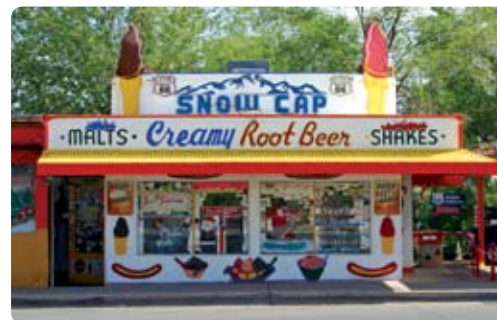
Delgadillo's Snow Cap Drive-In, Route 66