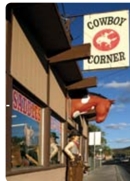
Cowboy Corner, Prescott

Day 6 > There's not much of Route 66 left “from Chicago to LA” but one of the longest sections remaining will take you on the scenic drive through Peach Springs, on the edge of the Hualapai Indian Reservation, to Kingman. You headed for the Fort Beale RV Park. 📍 90 miles to Kingman ★ Visit Grand Canyon Caverns, so named because the air travels sixty miles underground from the Canyon itself 🌐 www.ftbealerv.com