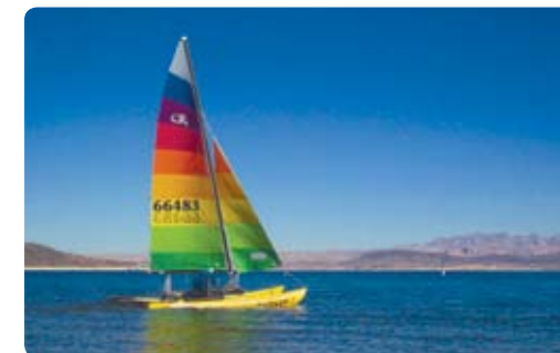
Sailing on Lake Mead, Boulder Basin