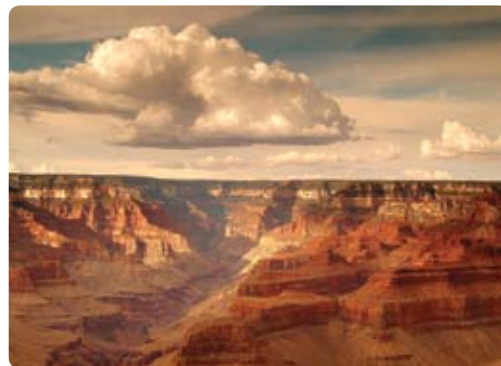
Sunset at Mather Point, Grand Canyon

Day 3 > The highlight of this little tour will be when you stand at the rim of this magnificent National Park. No photograph, painting or film begins to capture it: you just have to carry the memory away with you. We recommend the Mather campground which has showers and toilets though no electrical hook-ups. Do take an unforgettable helicopter trip over or into the Canyon. 📍 55 miles to the Grand Canyon Camper Village ★ Visit the Canyons rim as the sun goes down but be sure to be there again at first light 🌐 www.nps.gov/grca/planyourvisit/cg-sr.htm