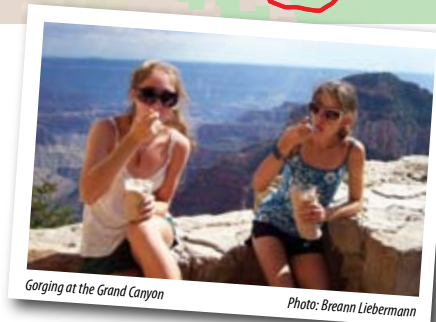
Gorging at the Grand Canyon