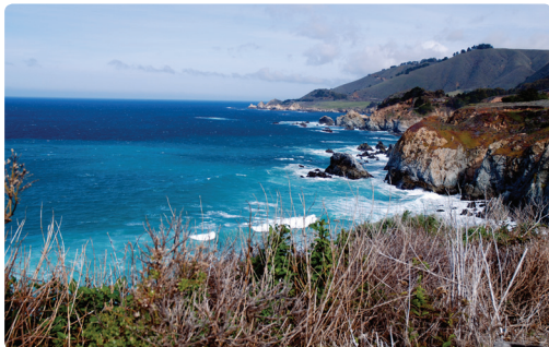
Above: Scenic views along Route 1

Day 3/4 > Head north on Route 1 and one of the world's most scenic drives. You will want to stop at Carmel and at Monterey and you will not want to miss the famous 17 mile drive which hugs the Pacific coastline and past famous golf courses and mansions in Pebble Beach. You're headed for San Francisco where your campsite next door to the 49ers stadium may not be the most rustic but is just four miles from the sights of the city using the campground's hourly shuttle. 📍 200 miles to San Francisco ★ Visit the Henry Cowell Redwoods