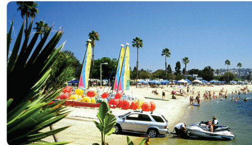
Campland on the Bay

Day 8 > Continue south on 395 through the Sierra Nevada and then to the flatter lands of the Mojave Desert. It's a gentle three hour drive. Overnight is in the town of Barstow, a crossroads town that once saw The Old Spanish Trail and Route 66 pass this way. Most visitors now are here for the two outlet malls and their one hundred stores. 📍 160 miles to Barstow ★ Take the shuttle from KOA to the silver mining ghost town of Calico 🌐 www.koa.com/where/ca/05233